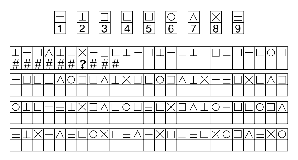
Figure 3. Illustration of the high-distraction version of the Symbol Digit Substitution Test.