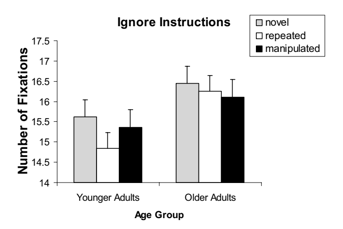
Figure 2. Means and standard errors for the number of fixations made to the novel, repeated, and manipulated scenes for younger and older adults who were either given free viewing or ignore instructions during the initial study blocks. Younger and older adults, regardless of instruction condition, showed a decrease in viewing behavior for the scenes that had been viewed throughout the experiment (repeated, manipulated) compared with those scenes that were novel.

inhibition (Hasher et al., 1999). This age-related inhibitory deficit, which was present in the first block on each of the eye movement measures, was lessened in the second block, suggesting that inhibitory deficits in older adults can be modulated (Hasher et al., 1997; Ryan et al., 2006).